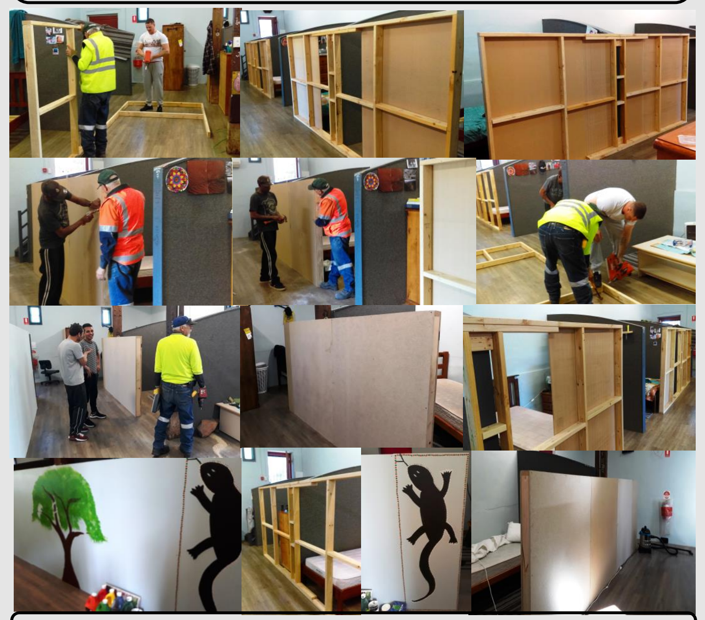
The clients at LAKALINJERI TUMBETIN WAAL (LTW) have been busy working on various projects in the TAFE SA Aboriginal Access Wood Work Course.

Construction of new partition walls in the dormitory buildings at LTW. The clients have been working with TAFE SA Lecturer Ian Carter as part of the Aboriginal Access Wood Work Course to build the partition walls - measuring, planning, cutting and constructing. Clients then painted them a pale blue to match the walls and they have now begun to add art work to the walls .