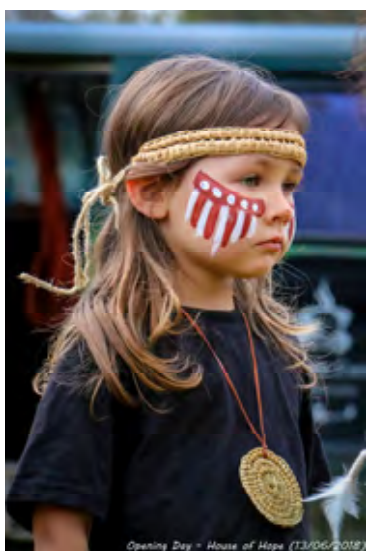
Opening Day - House of Hope (13/06/2018)