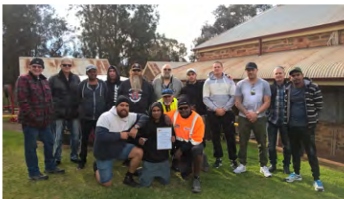
Recent Graduation Ceremony at Lakilenjeri Tumbetin Waal (LTW)