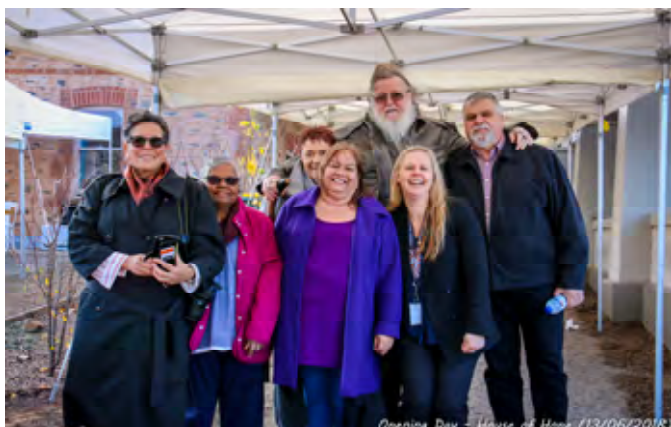
Opening Day - House of Hope (13/06/2018)