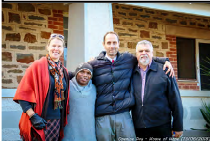
Opening Day - House of Hope (13/06/2018)