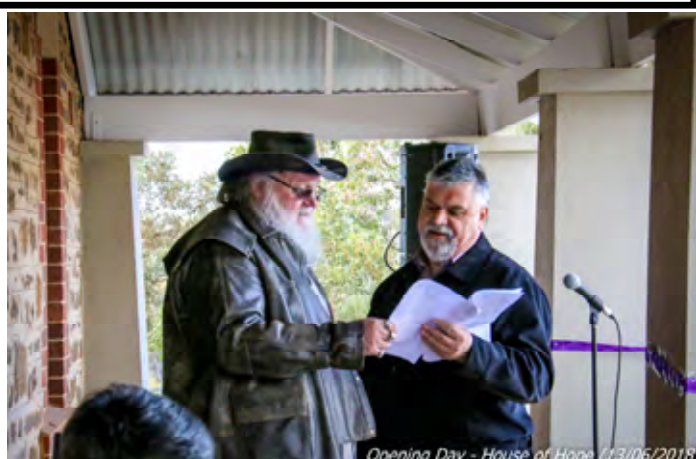
Opening Day - House of Hope (13/06/2018)