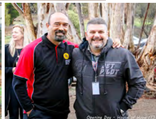
Opening Day - House of Hope (13/06/2018)