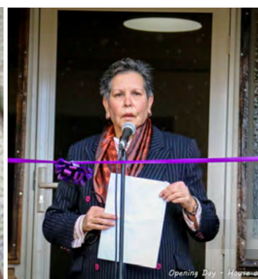
Opening Day - House of Hope (13/06/2018)