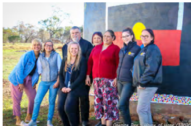
Opening Day - House of Hope (13/06/2018)