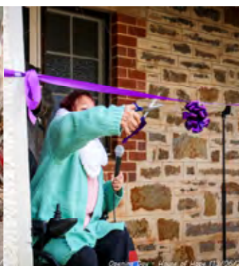
Opening Day - House of Hope (13/06/2018)