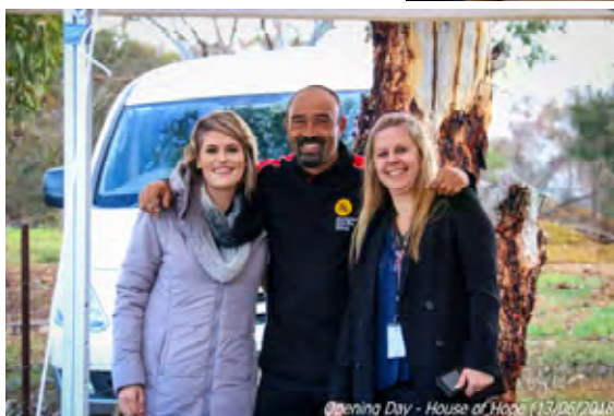
Opening Day - House of Hope (13/06/2018)