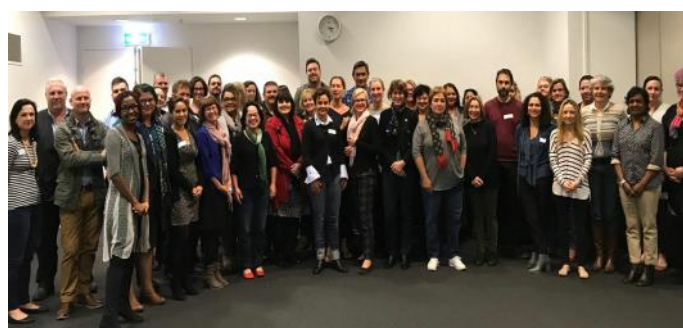
Recently in Berri we hosted Ngangkari Traditional Aboriginal Healers and we are hoping to continue this on a monthly basis.