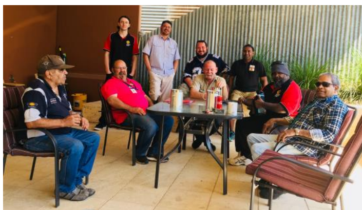
Some of the fellas enjoying the beautiful weather at the Riverland Aboriginal Men's Support Group.