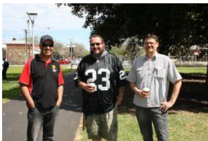
A few of the boys at the recent ASG and NUNK Community Fun Day held at Whitmore Square, Adelaide.