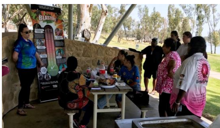
Moorundie Mimini's Group Aboriginal Health Council Puyu Blasters talk held at the Loxton riverfront earlier this month.