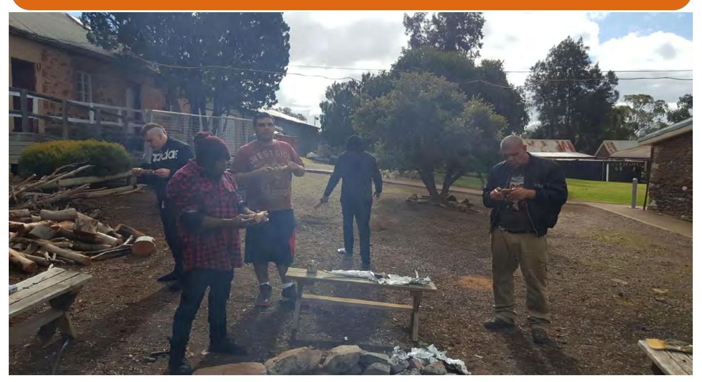
ASG Newsletter July 2016

One of the participants at LTW cooking up a storm for the entire group. Under the guidance of an LTW worker, the lasagne and muffins were made from scratch. The client is very proud of himself as is the worker and he is working very hard on the program making good progress so far. Looks great too!! Below - enjoying Roo tail back at LTW.