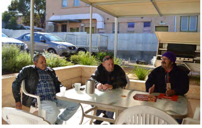
ASG Newsletter July 2016